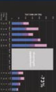
Hair Production System with Dermatopoietin®

Contains Dermatopoietin® (rh-Polypeptide 17) and Hexapeptide 18. It significantly stops hair loss. Clinically proven. Application: daily in the evening of the day 1 to 4; apply the serum onto the scalp area, massage gently into the skin, leave overnight, and wash off in the morning. To continue the effect, use HAIR PROTECTION SYSTEM SERUM DAY 5 TO 14.*