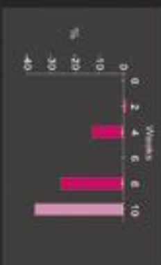
Results: Number of Dark Spots