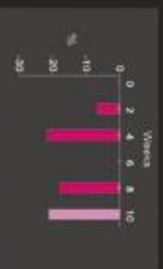
Results: Hypodermis-Dermis junction distance

Significantly reduces visual appearance of cellulite. Diminishes irregularities of dermis and dermis-hypodermis junction. Contains Dermatopoietin® (rh-Polypeptide 17) and Hexapeptide 18. Clinically proven. Application: daily, massage into the cellulite-affected skin for one month. To continue the effect, use GENERAL PURPOSE SKIN EMULSION for the next month.*